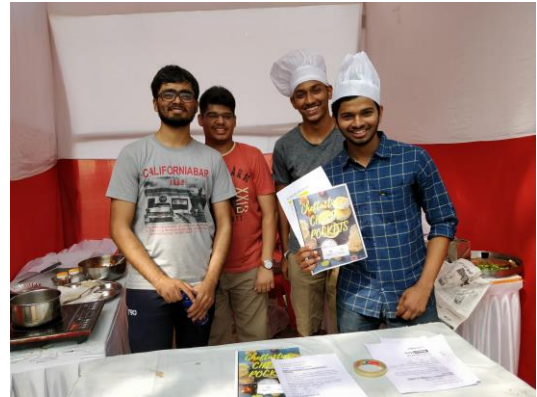
Participants at Chefpreneur