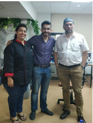
Judges of Final round of Chefpreneur