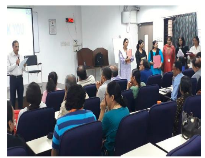
Parent Proctor Meeting