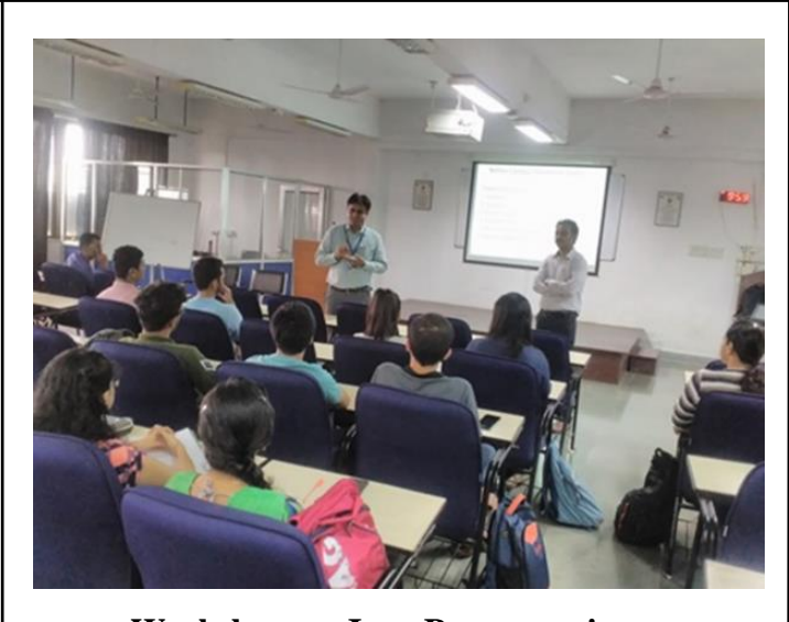
Workshop on Java Programming