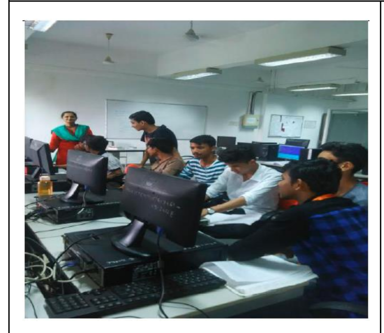
Workshop on Problem Solving and Programming