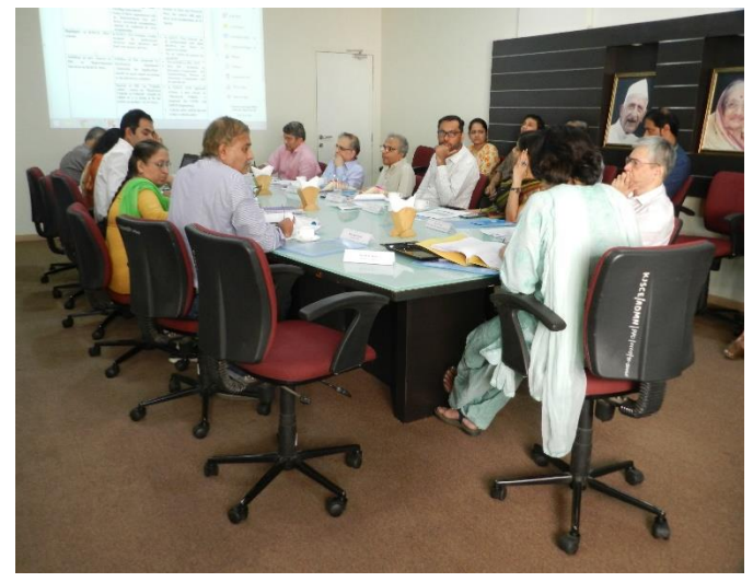
Subject Board Meeting