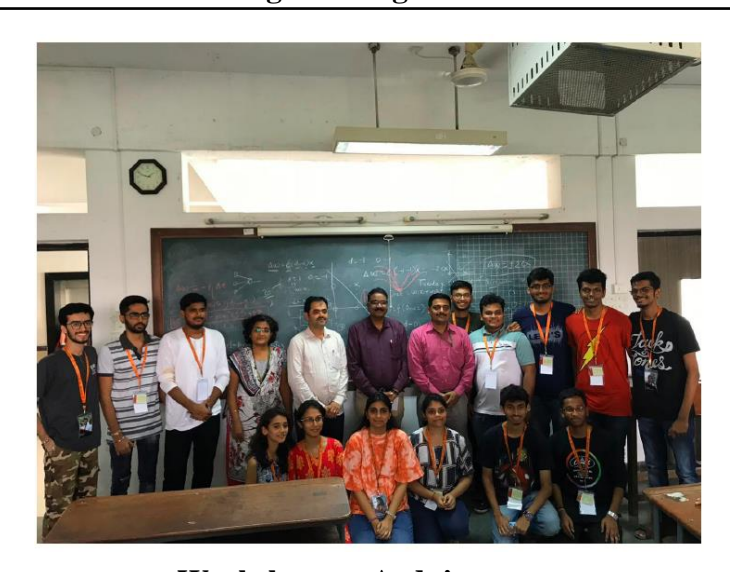
Workshop on Arduino