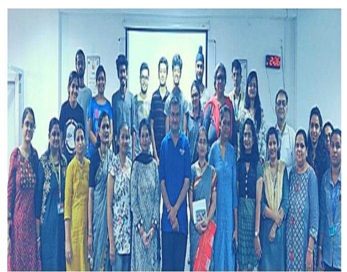
Workshop on meditation music