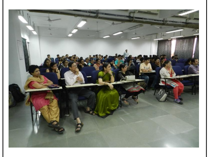
FY Induction Program