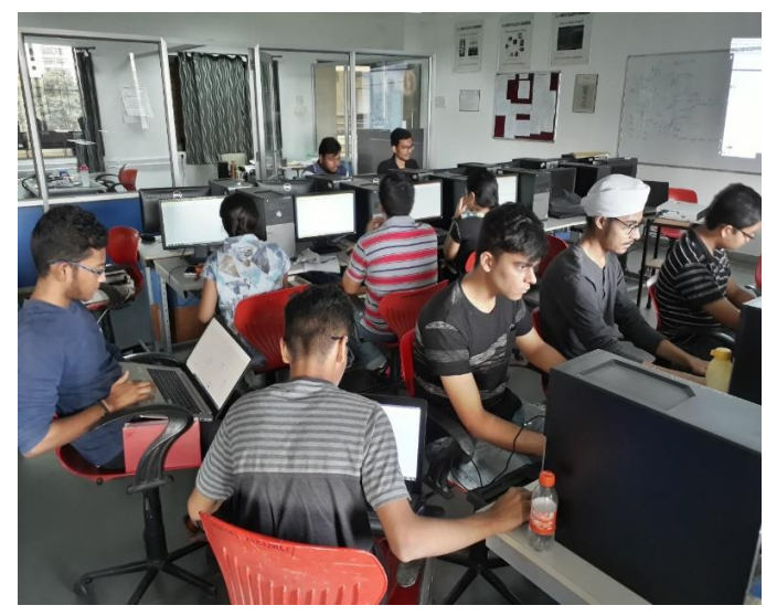
LT Spice hands-on workshop II