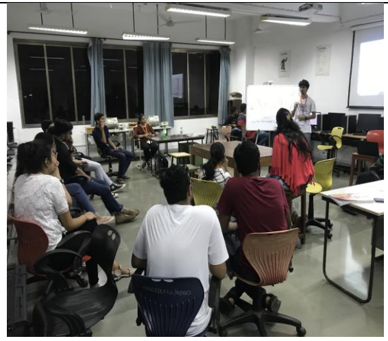
Circuit designing Workshop