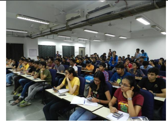
Workshop on Calculator