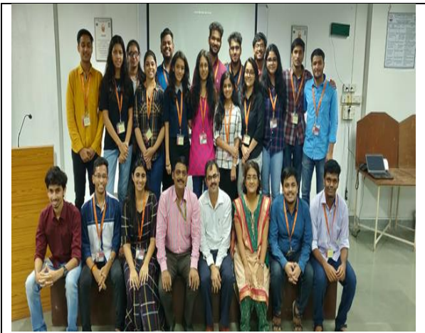
EESA Council 2019-20