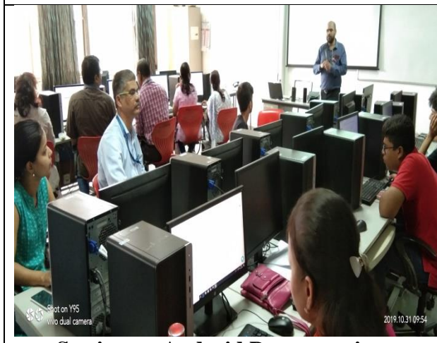
Session on Android Programming