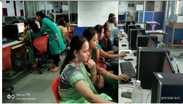
Workshop on eSIM