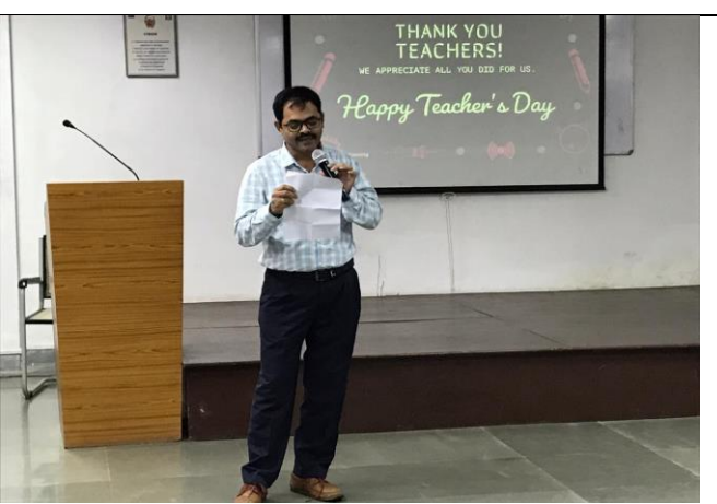
Teachers' Day Celebration