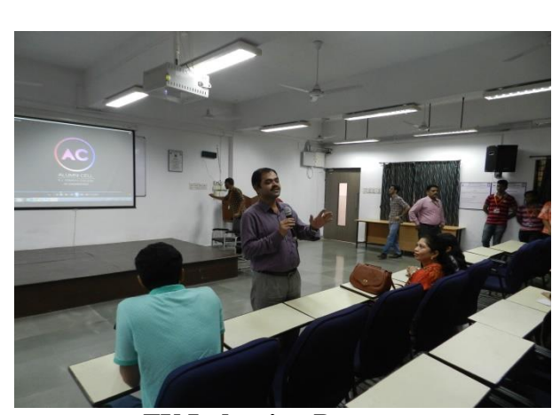
FY Induction Program