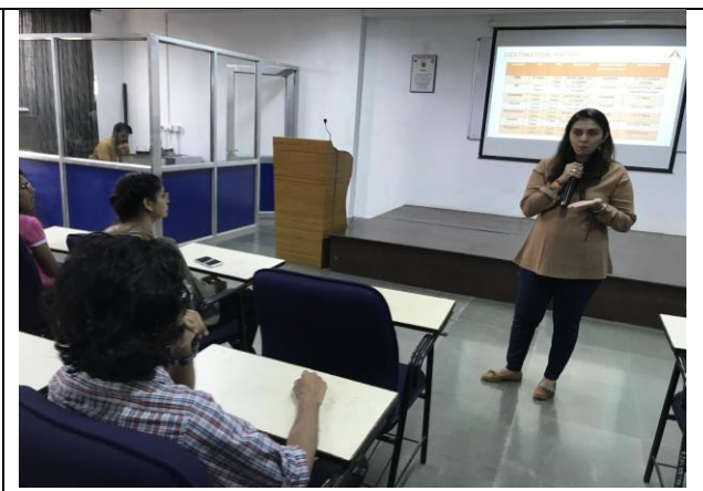
Session on GRE and Overseas Education