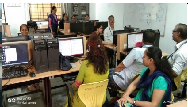
Workshop on Virtual Instrumentation