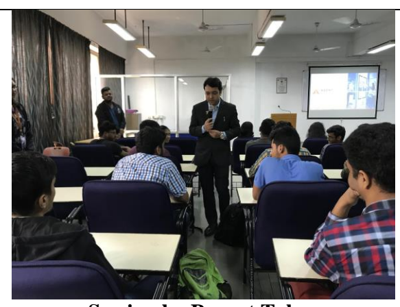
Session by Puneet Takur